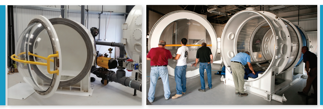
Midland Altitude Chamber Complex (MACC) operated by Orbital Outfitters

Renovations have been completed to the 79,346 sq. ft. facility at the Midland Spaceport Business Park. XCOR is operating its headquarters and research and development out of the west 35,138 sq. ft. portion of the facility. At the request of the MDC, XCOR agreed to release their lease on the 44,205 sq. ft. east hangar and offices back to the MDC to use for the attraction of additional aviation/aerospace companies.