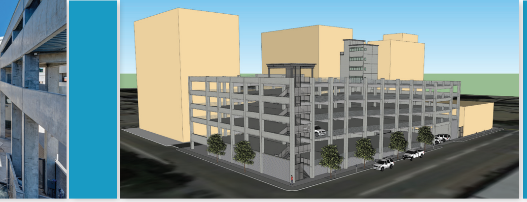
COG Parking Garage on Wall Street Rendering

The SH 349 expansion project also laid the groundwork for the expansion of SH 158.