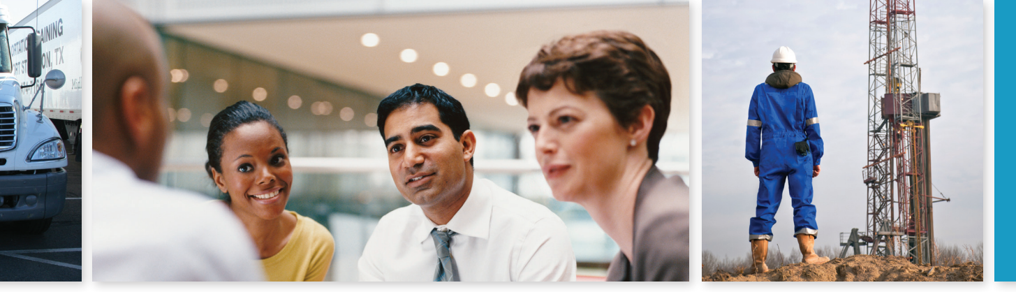
Diversified Workforce in Midland