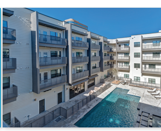
Wall Street Lofts Parking Garage (far right)